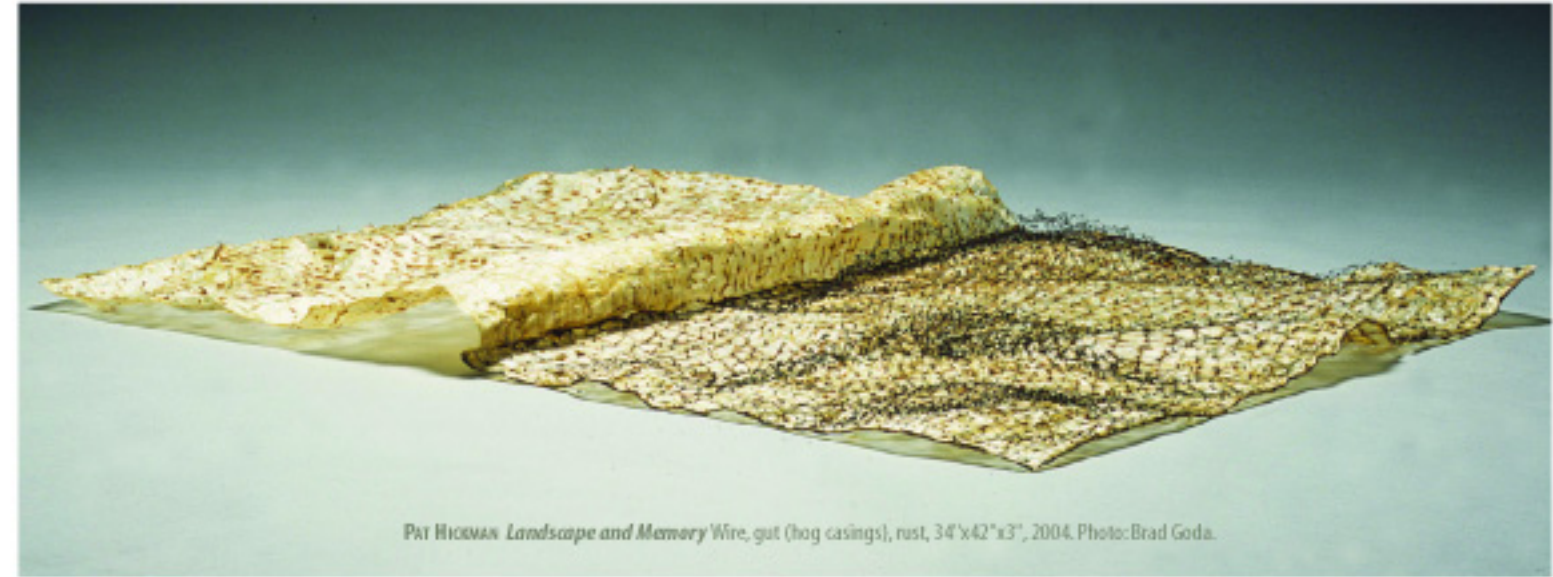
PAT HICKMAN Landscape and Memory Wire , gut (hog casings), rust, 34'x42"x3", 2004.